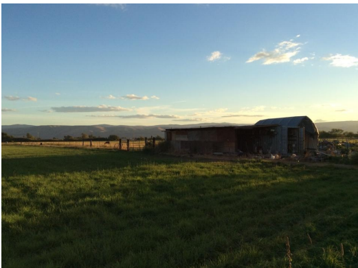
Kittitas County has many diverse and valuable rural and open spaces

Planning for population growth is a regional effort requiring coordination amongst all jurisdictions in Kittitas County, including the County itself. Due to this regional approach, it is necessary for the County to coordinate with local jurisdictions' planning efforts to ensure consistency throughout the update process. Coordination is primarily accomplished through the County-wide Planning Policies adopted by the Kittitas County Conference of Governments (COG) and the joint effort in developing population allocations. However, each jurisdiction will be conducting its own Comprehensive Plan update to reflect its unique characteristics.